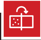
Image Classification (Before/After/During):

A separate classifier is trained to categorize images based on their stage in the property preservation process (before repairs, during repairs, after repairs).